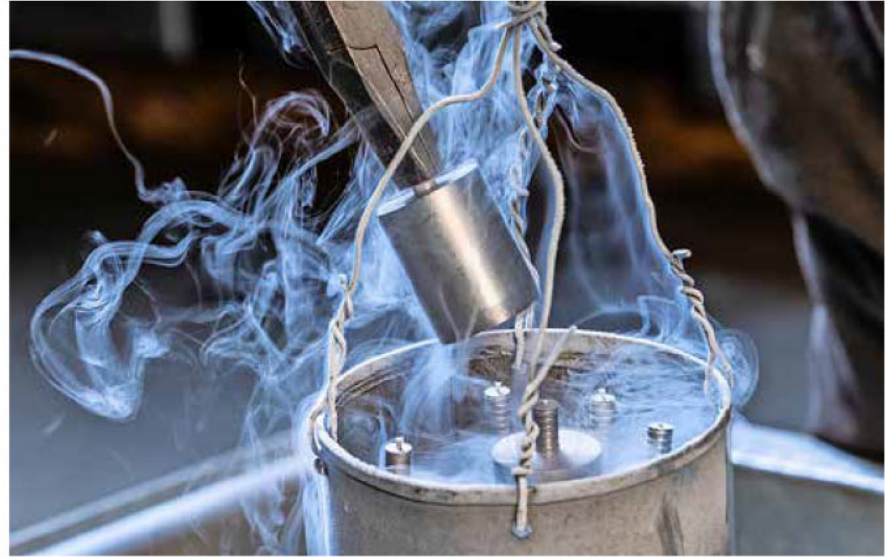
Before use, a freeze-fit plug must be cooled down to -196^{\circ}\text{C} with liquid nitrogen, while the corresponding die insert must be heated to 350^{\circ}\text{C} .

option and had remained in use despite continued new approaches.